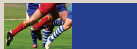
Sports Injuries of the Foot and Ankle Course

"Although country western dancing and mechanical bull riding in Texas may not be as recognizable as other sports, I can say with certainty that attendees will have the opportunity for personal sports participation while also being exposed to the newest advances and emerging technologies in foot and ankle care of the more traditional athlete from